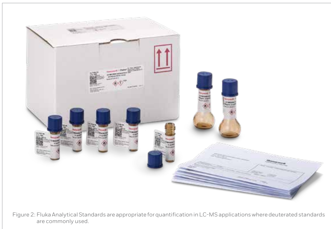
Figure 2: Fluka Analytical Standards are appropriate for quantification in LC-MS applications where deuterated standards are commonly used.

Honeywell Research Chemicals has formulated a portfolio of Fluka™ Analytical Standards that make it easier for laboratories to verify the safety of a wide range of products. These high-quality inorganic and organic reference materials have been a market leader for almost 30 years and are quantitatively tested to confirm their composition. Because the standards are developed and QC-tested in Honeywell's ISO 9001-accredited laboratory in Seelze, Germany, they also help satisfy audit and regulatory requirements.